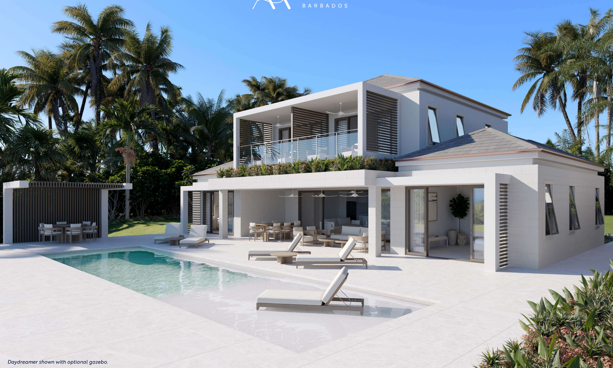
Daydreamer shown with optional gazebo.